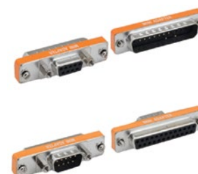
DB-9 to DB-25