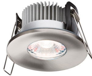
Shown with Bezel (not included)