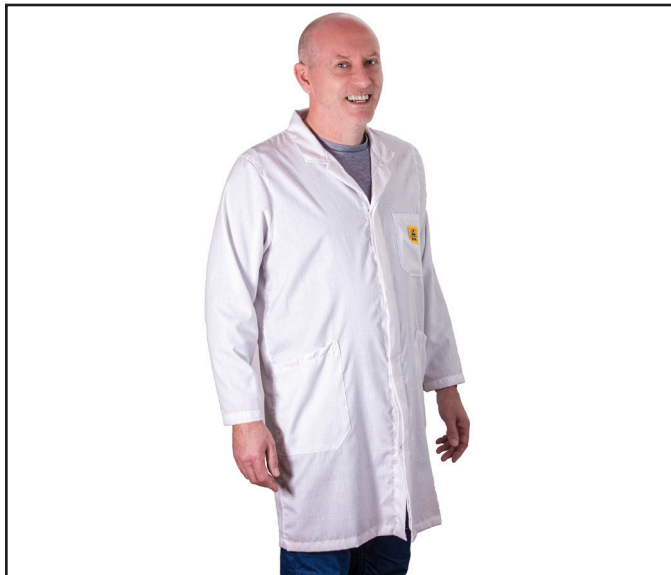
Figure 1. RS Static Dissipative Lab Coat