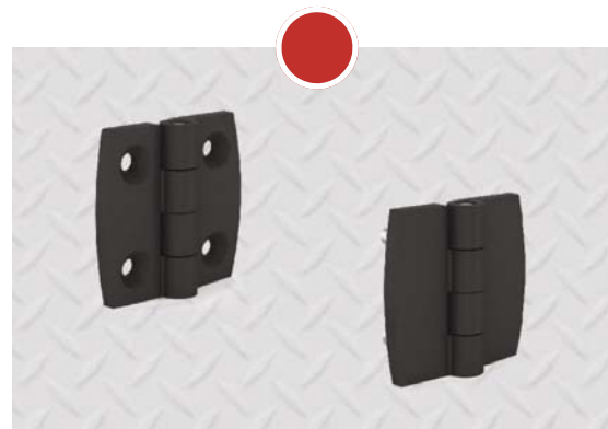
Square designed hinges