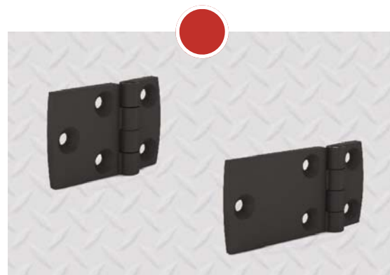
Asymmetrical designed hinges

Pinet are able to produce special versions (please contact us for details).