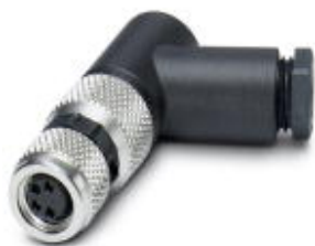
Connector, 4-position, Socket angled M8, A-coded, Screw connection, Knurl material: Nickel-plated brass, External cable diameter 3.5 mm ... 5 mm

Please be informed that the data shown in this PDF Document is generated from our Online Catalog. Please find the complete data in the user's documentation. Our General Terms of Use for Downloads are valid ( http://phoenixcontact.com/download )