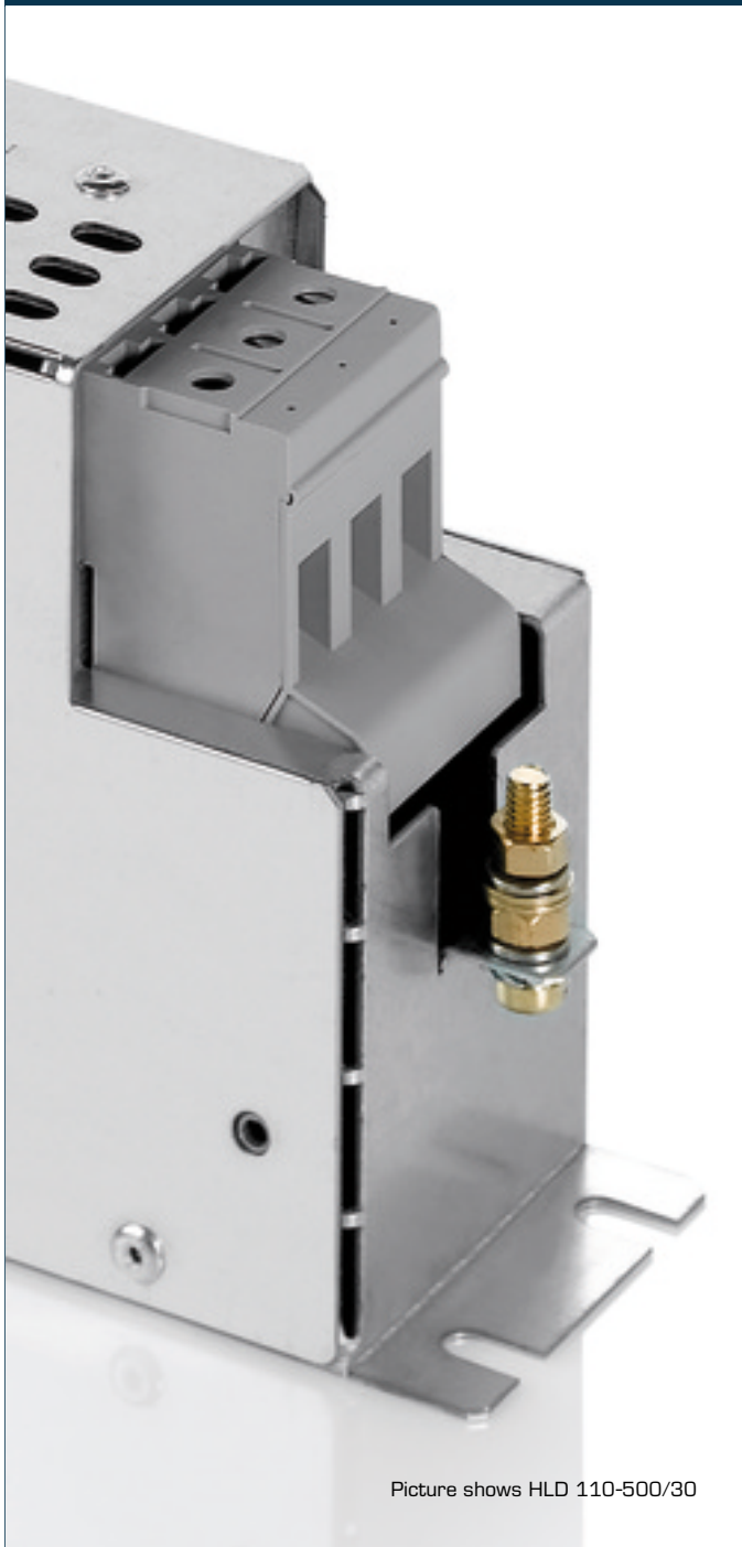
Picture shows HLD 110-500/30