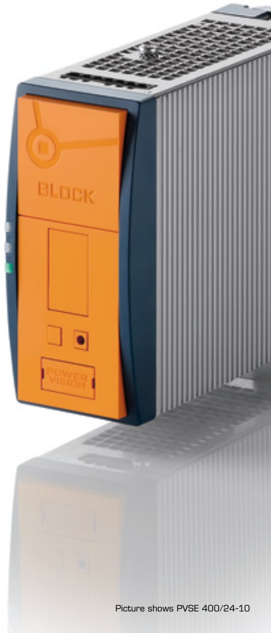
Picture shows PVSE 400/24-10