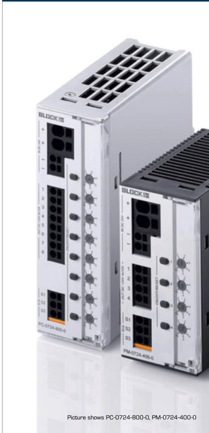
Picture shows PC-0724-800-0, PM-0724-400-0