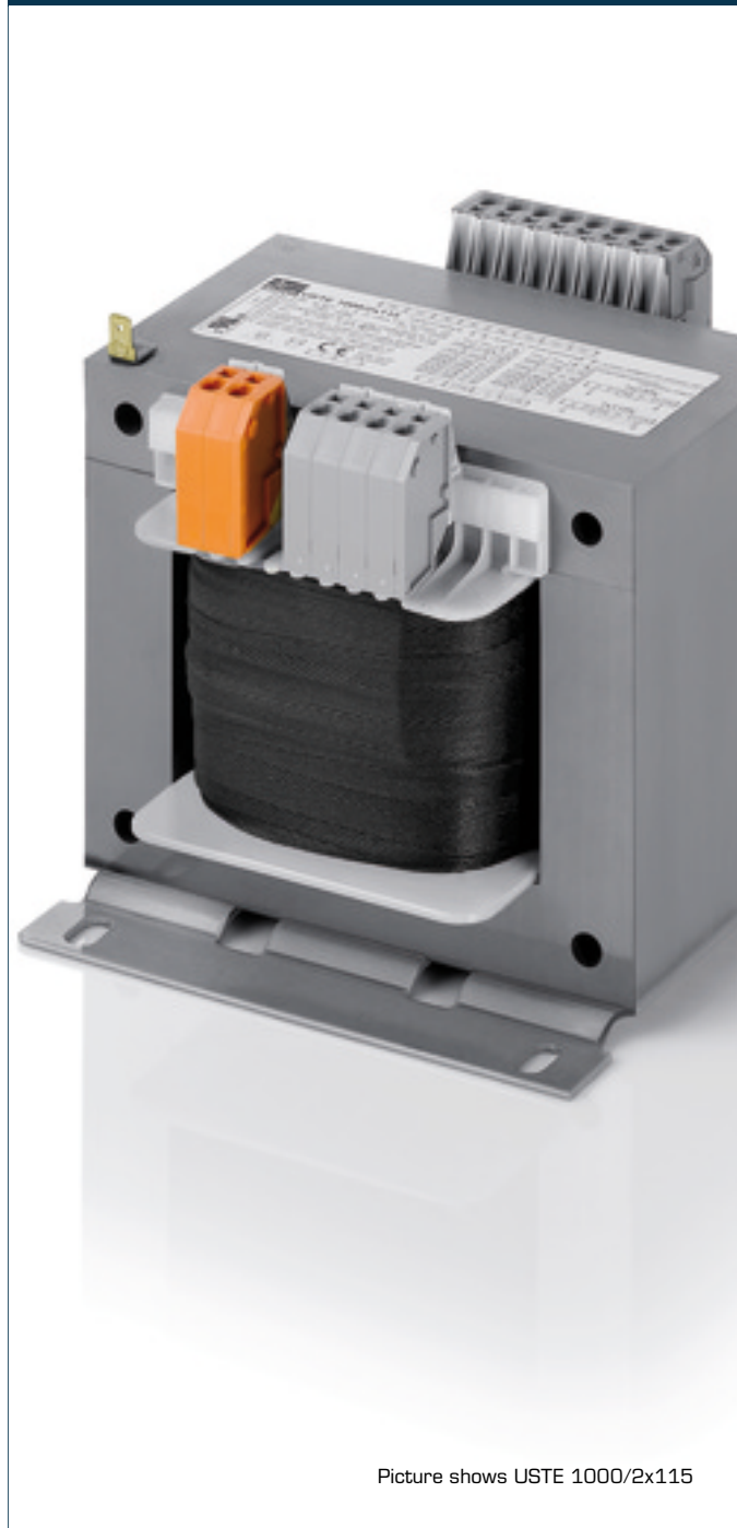
Picture shows USTE 1000/2x115