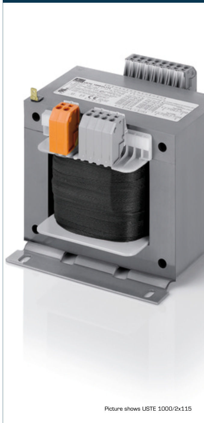
Picture shows USTE 1000/2x115