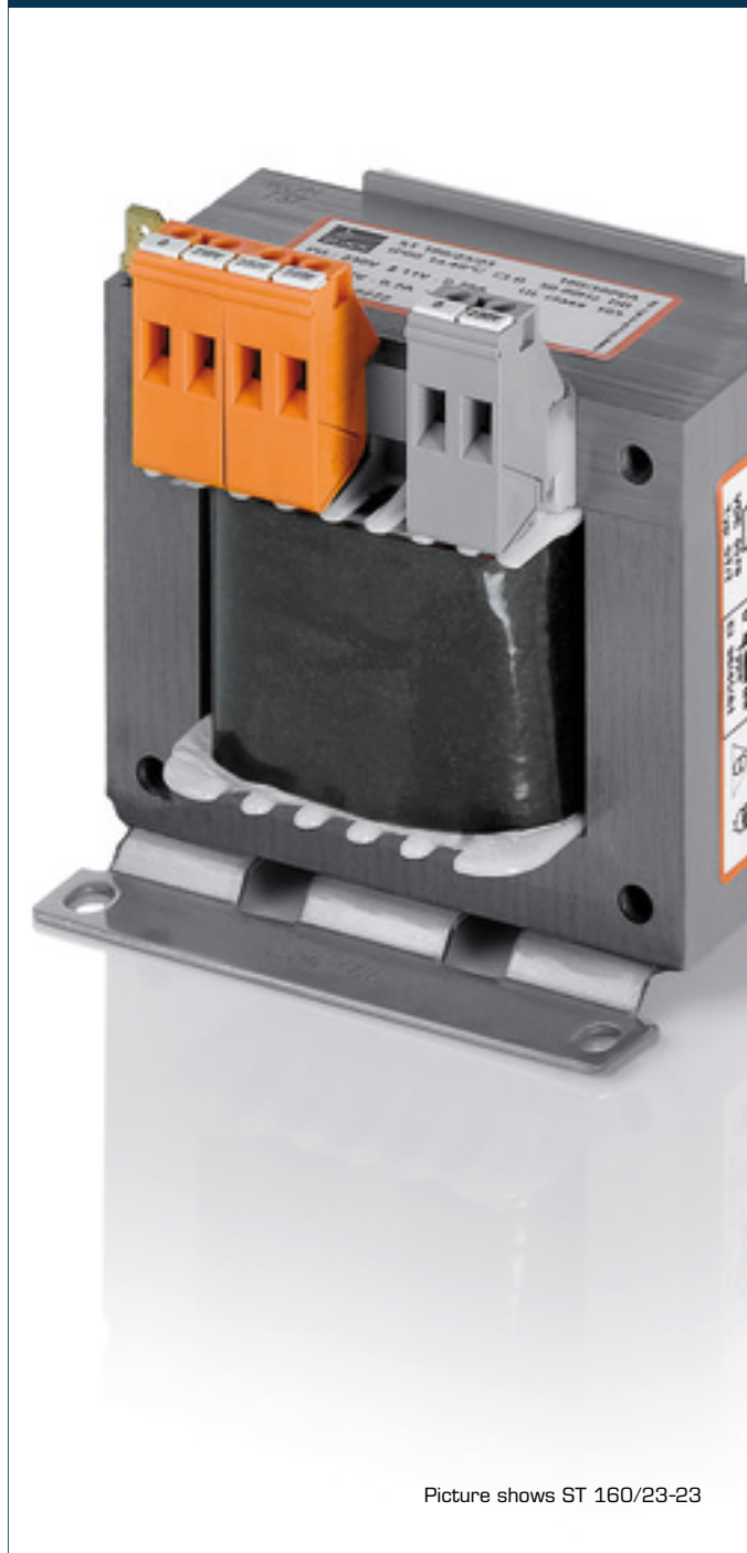
Picture shows ST 160/23-23