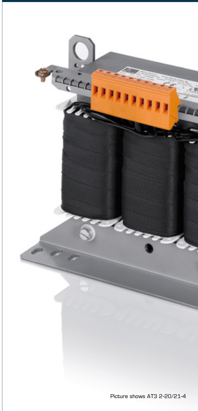
Picture shows AT3 2-20/21-4