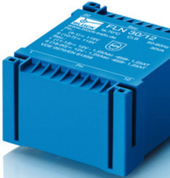
Picture shows FLN 30/12