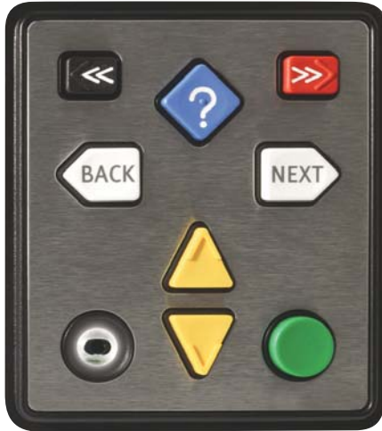
8 Keys with integral USB interface

with audio processor and illuminated audio jack socket