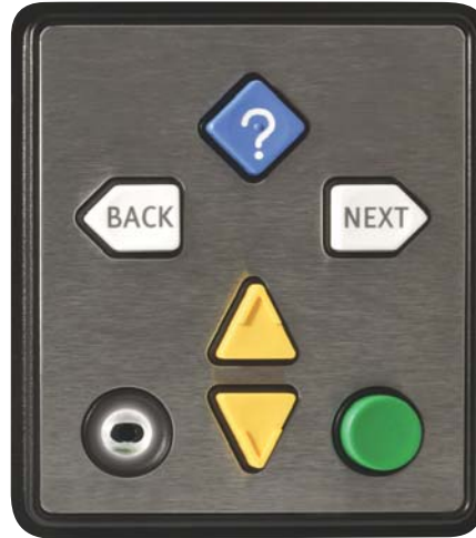
6 Keys with integral USB interface