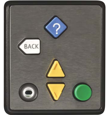
5 Keys with integral USB interface