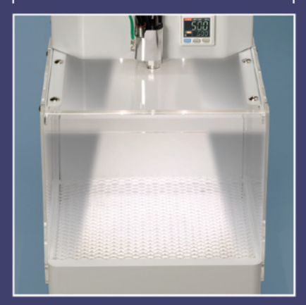
The white LED illuminates the work piece to ensure complete dust removal.