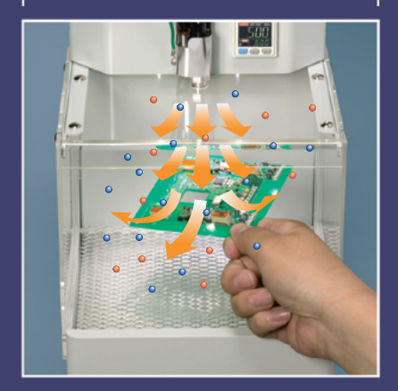
Direct ion emission paired with pulsed air emission provides quick and effective removal of static charges along with any dust that is present on the part.