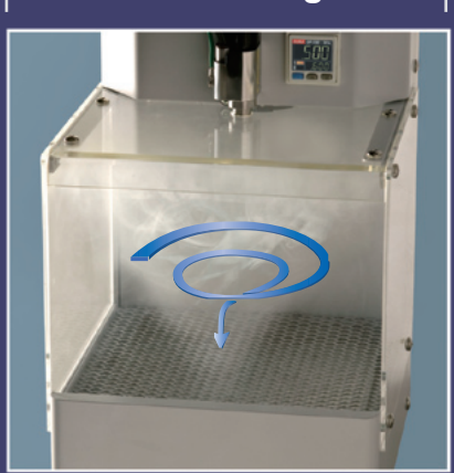
A powerful dust collecting fan exhausts dust quickly, preventing re-adhesion of dust.