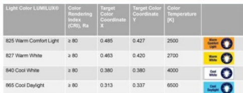
Light colors, color rendering properties and Light Color Coordinates for OSRAM DULUX® - lamps with integrated control gear

1 | Datumname | ORG CODE | Initial Technische Zeichnung | T15000000