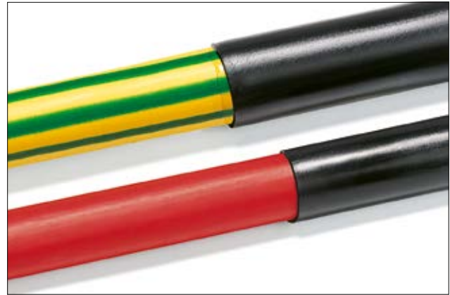
TA32 and TA42 are UL224 listed adhesive lined tubing. Available in 3:1 and 4:1 shrink ratio.