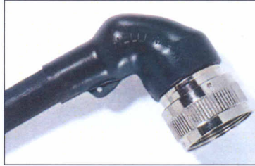
1152-4-G recovered onto a connector.

This style provides strain relief for harness systems when used in conjunction with a circular grooved adaptor. For VG shapes with portholes "P" please refer to product standards tables in the appendix.