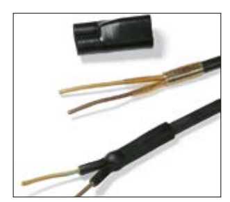
Adhesive tape HMT200A for sealing against humidity.