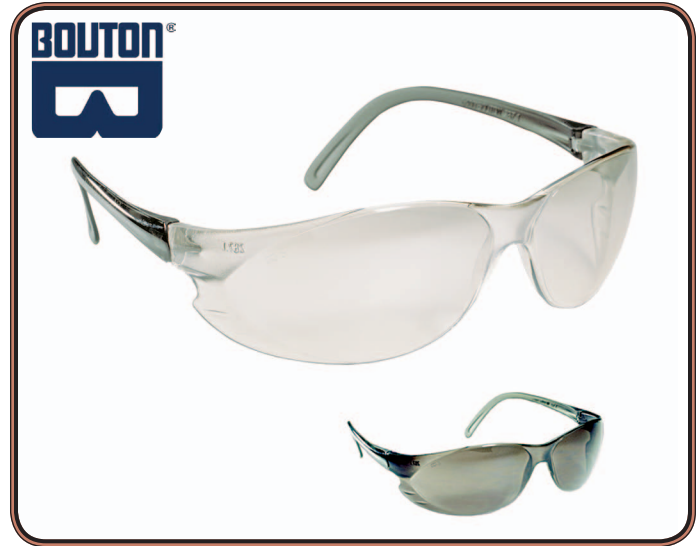
Polycarbonate lenses block 99.9% of the sun's ultraviolet rays. This ultraviolet protection has already been incorporated within the lens material when the lenses are being produced.