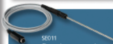
SE011 General-purpose probe

Connects discrete wires to the PT-104 without soldering. Suitable for wire-ended sensors and custom circuits.