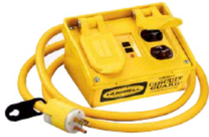
4 Outlet, Yellow