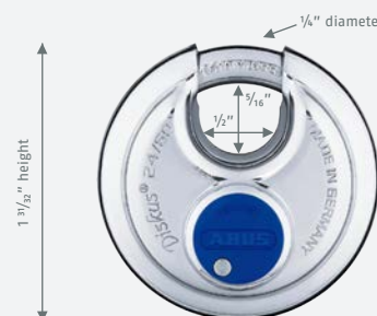
2" width 24IB/50