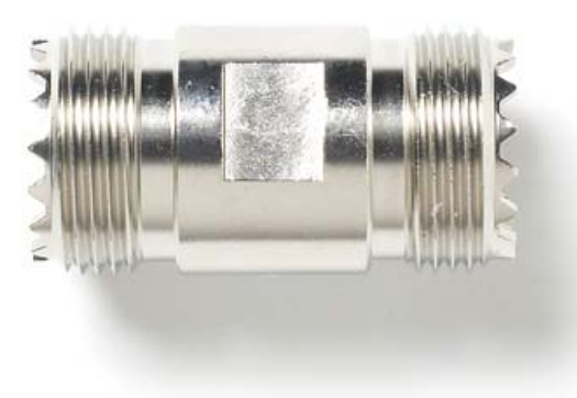
Model 73058 UHF Jack to Jack Adapter