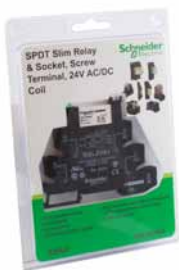
SPDT slim relay & socket, screw 24 V