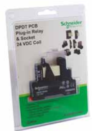
DPDT PCB plug-in relay & socket 24 VDC