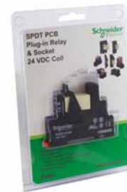
SPDT PCB plug-in relay & socket 24 VDC