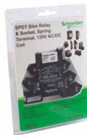
SPDT slim relay & socket, spring 120 V