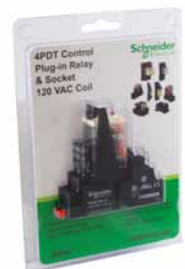
4PDT control plug-in & socket, 120 VAC