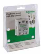
25 A panel mount SSR, DC control