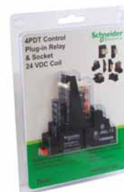
4PDT control plug-in & socket, 24 VDC