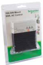
10 A DIN mount SSR, AC control