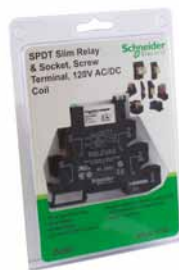
SPDT slim relay & socket, screw 120 V