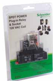
SPDT POWER plug-in relay & socket, 120 VAC