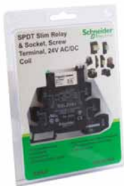
SPDT slim relay & socket, screw 24 V