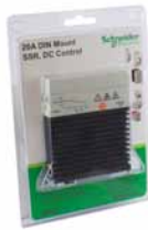
20 A DIN mount SSR, DC control