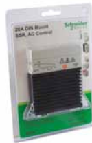
20 A DIN mount SSR, AC control