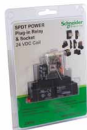
SPDT POWER plug-in relay & socket, 24 VDC