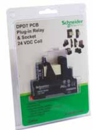
DPDT PCB plug-in relay & socket 24 VDC