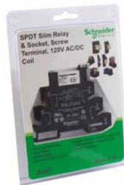
SPDT slim relay & socket, screw 120 V