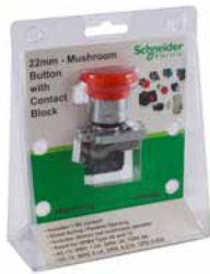
22 mm mushroom button with contact block