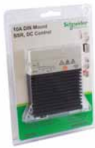
10 A DIN mount SSR, DC control