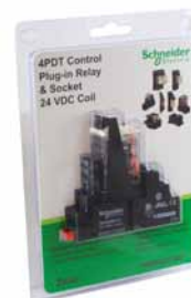
4PDT control plug-in & socket, 24 VDC