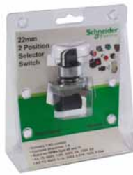
22 mm 2-position selector switch