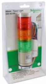
40 mm tower light