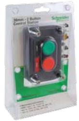
22 mm 2 button control station