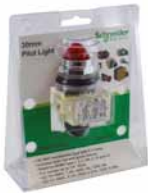
30 mm pilot light