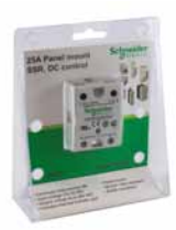
25 A panel mount SSR, DC control