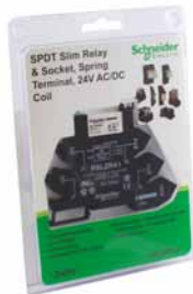
SPDT slim relay & socket, spring 24 V