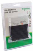
10 A DIN mount SSR, AC control