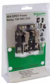
40 A DPDT