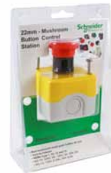
22 mm mushroom control station