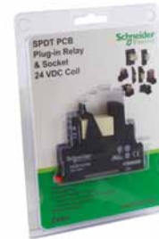
SPDT PCB plug-in relay & socket 24 VDC