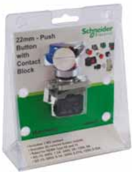
22 mm pushbutton with contact block