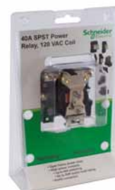
40 A SPST