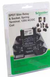
SPDT slim relay & socket, spring 120 V