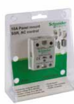
10 A panel mount SSR, AC control