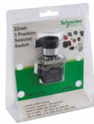
22 mm 3-position selector switch