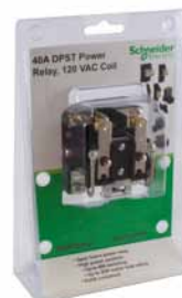
40 A DPST