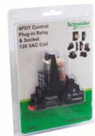
4PDT control plug-in & socket, 120 VAC