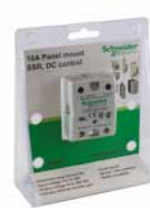
10 A panel mount SSR, DC control