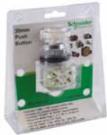
30 mm pushbuttons