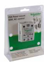
25 A panel mount SSR, AC control