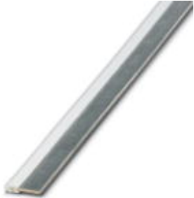
Continuous plug-in bridge, length: 500 mm, number of positions: 1, color: gray

Please be informed that the data shown in this PDF Document is generated from our Online Catalog. Please find the complete data in the user's documentation. Our General Terms of Use for Downloads are valid ( http://phoenixcontact.com/download )