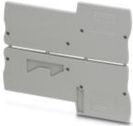
End cover, Length: 90 mm, Width: 2.2 mm, Color: gray

Please be informed that the data shown in this PDF Document is generated from our Online Catalog. Please find the complete data in the user's documentation. Our General Terms of Use for Downloads are valid ( http://phoenixcontact.com/download )