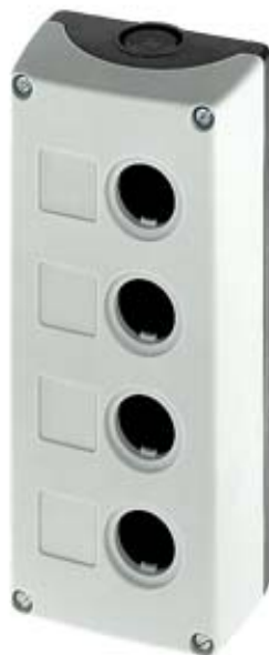
ENCLOSURE FOR 22MM PROGRAM METAL VERSION 4 COMMAND POSITIONS GRAY TOP PART