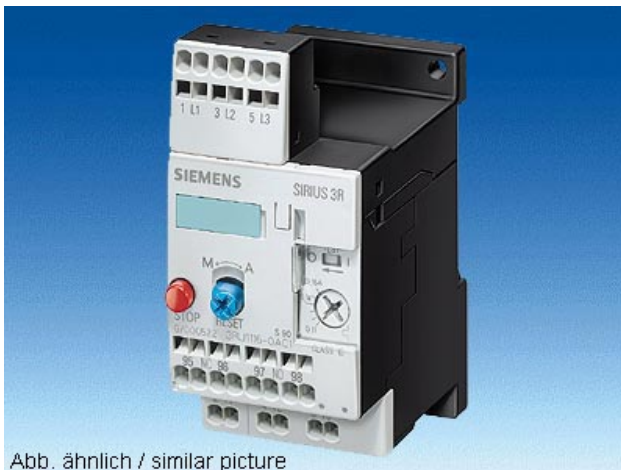
Abb. ähnlich / similar picture

OVERLOAD RELAY, 3.5...5 A, 1NO+1NC, SIZE S00, CLASS 10, CAGE CLAMP CONNECTION, FOR INSTALLAT. AS A SINGLE UNIT