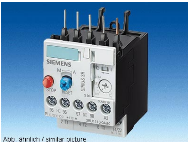
Abb. ähnlich / similar picture

OVERLOAD RELAY, 3.5...5 A, 1NO+1NC, SIZE S00, CLASS 10, FOR CONTACTOR MOUNTING