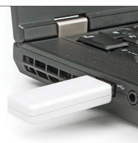
Figure 1-3: USB Dongle plugged into Laptop USB host connector

Unfortunately not. If you lose your dongle you will need to buy a new compiler license and pay the full price.