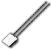
700 Series temperature sensor, thin film, platinum RTD, platinum-clad nickel wire

( Home (/index.php?ci_id=3972&la_id=1) : Products (/products) : Active Product Family 10-Oct-2006 : Temperature Sensors : Discrete RTD Sensors : 700 )