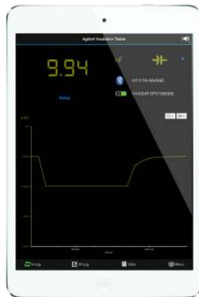
Figure 3. Data logging interface on Agilent Insulation Tester Application