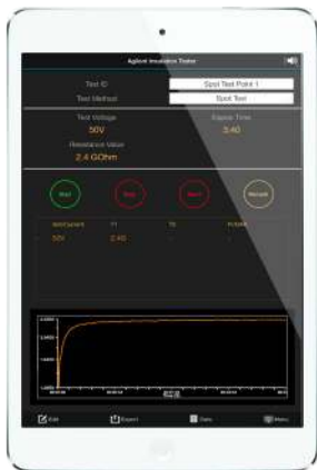
Figure 2. Perform remote testing with Agilent InsulationTester Application