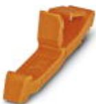
Latching, Number of positions: 1, Color: orange