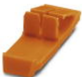
Latching, Number of positions: 2, Color: orange