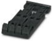
Strain relief, Number of positions: 4, Color: black