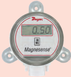
Standard MS with optional LCD