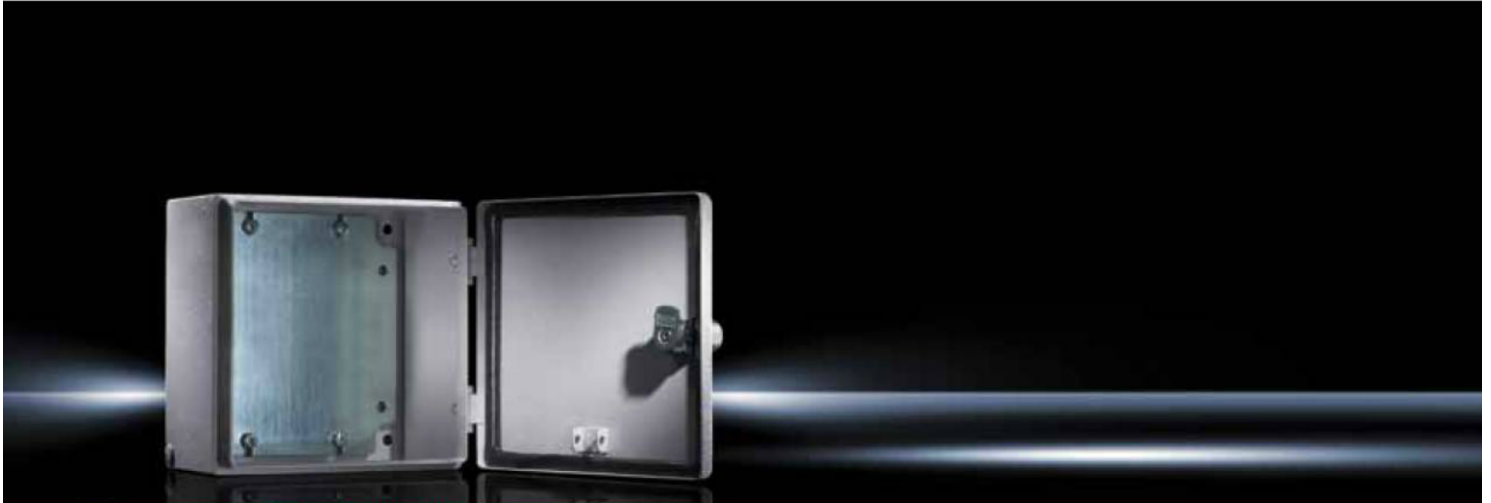
System accessories Page 531 E box EMC-shielded 243