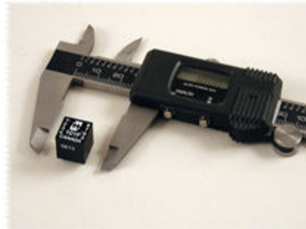
Caliper in photo opened to 1" (25.4mm)