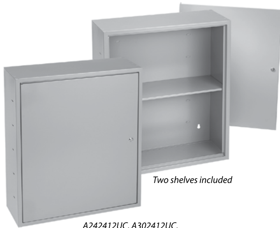
Two shelves included

A242412UC, A302412UC, A362412UC, A363012UC