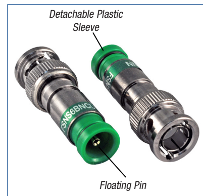
FSNS6BNCU ProSNS™ Universal BNC Series 6 Connector

Like our 59 and 6 connectors, the ProSNS™ RG-11 F connectors utilize a plastic pin guide for greater connector performance and easy installation.