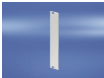
Illustration shows front panel 3 U, 4 HP