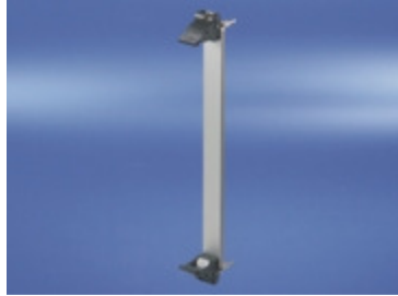
Illustration shows front panel 6 U, 4 HP