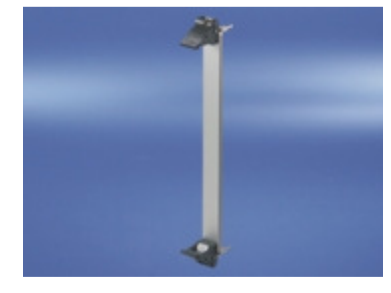
Illustration shows front panel 6 U, 4 HP