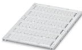
The figure shows the UCT-TM 5 version

UniCard materials for thermal transfer printer, for labeling Weidmüller, Conta Clip, and Klemsan terminal blocks, 72-section, can be labeled with THERMOMARK CARD and BLUEMARK LED, color: white