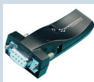
BL-830 BLUETOOTH 1xRS232 FEMALE DCE - CLASS 2