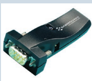
BL-819: BLUETOOTH 1xRS232 MALE DTE - CLASS 2