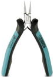
Electronic round-nose pliers, smooth grip, with opening spring

Please be informed that the data shown in this PDF Document is generated from our Online Catalog. Please find the complete data in the user's documentation. Our General Terms of Use for Downloads are valid ( http://download.phoenixcontact.com )