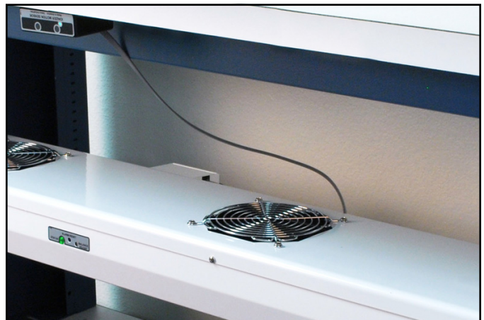
Figure 5. Using the Ionizer Motion Sensor with the 60473 Chargebuster® 3-Fan Overhead Ionizer