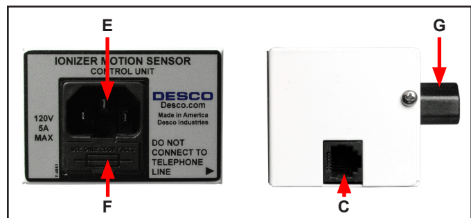
Figure 3. Control Unit features and components

A. Power LED: This LED will illuminate blue when an operator or object has activated the device.