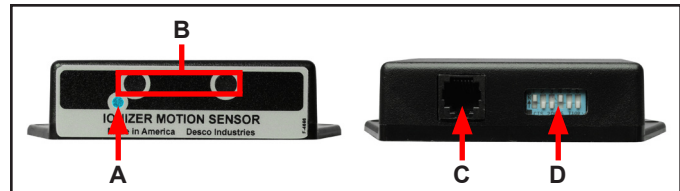
Figure 2. Sensor Unit features and components