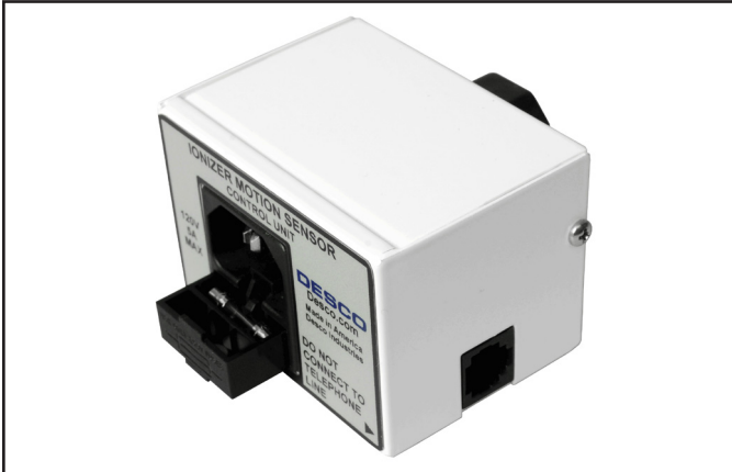
Figure 6. Replacing the fuse in the Control Unit