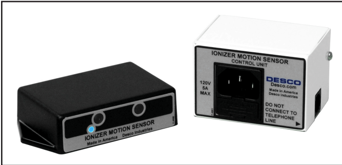
Figure 1. Desco 60509 Ionizer Motion Sensor