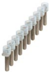
Jumper, Number of positions: 10, Color: silver

Please be informed that the data shown in this PDF Document is generated from our Online Catalog. Please find the complete data in the user's documentation. Our General Terms of Use for Downloads are valid ( http://download.phoenixcontact.com )