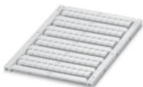
The figure shows the UCT-TMF 5 version

UniCard materials for thermal transfer printers, for labeling Weidmüller, Conta Clip, and Klemsan terminal blocks with horizontal marker groove, 72-section, can be labeled with THERMOMARK CARD and BLUEMARK LED, color: white