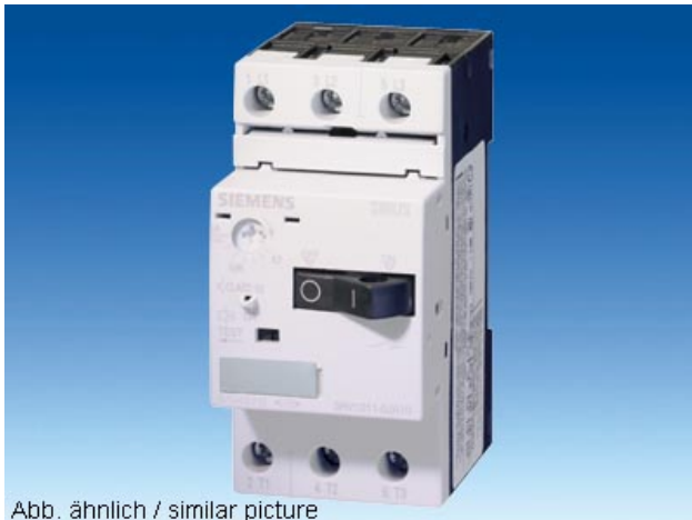
Abb. ähnlich / similar picture

CIRCUIT-BREAKER SIZE S00, FOR MOTOR PROTECTION, CLASS 10, A-REL.0.9...1.25A, N-REL.16A, SCREW TERMINAL, STANDARD SWITCHING CAPACITY